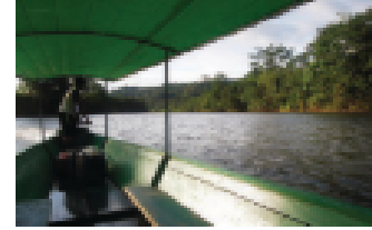
Crossing the Amazon must be done by boat because there are no bridges.

Flowing from the Andes Mountains, the Amazon River is the second longest river in the world, measuring in at 6,347 km. The river runs through Ecuador, Venezuela, Brazil, Colombia, Guyana, Peru and Bolivia in South America. During the wet season, the Amazon River grows and can reach over 190 kilometres in width, however there are no bridges that cross the river. The largest city along the Amazon is Manaus in Brazil. The city is home to around 1.7 million people.